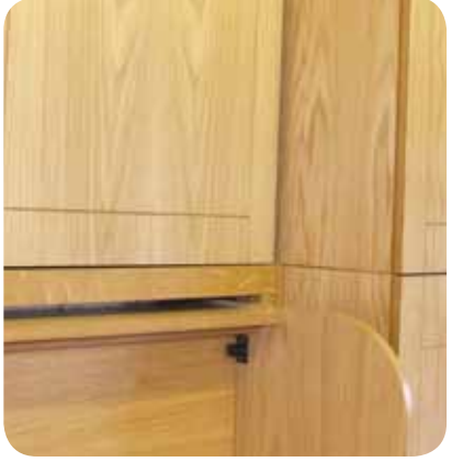
Top quality real wood veneers

We put considerable time and effort into ensuring use of the finest materials from sustainable sources. Manufactured in the UK, the StudyBed exudes quality and workmanship in every respect, from the superior top grade veneer down to the smallest practical detail, giving you a beautiful but highly functional item of furniture that will delight for many years.