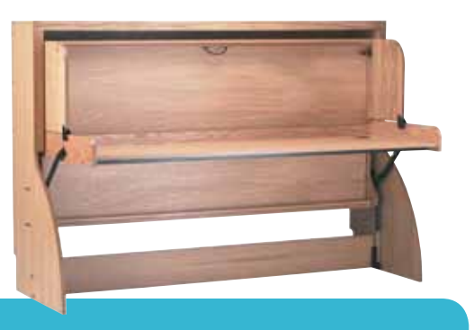
Single StudyBed £1300 + Vat (£1560)*