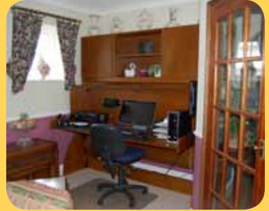
Oak StudyBed stained to match existing decor

The cost for this bespoke service is an additional 10%