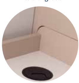
Cappuccino and white