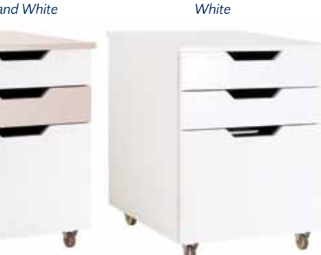
"It has made the room look so much neater and nicer"