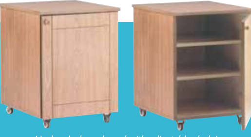
Under-desk cupboard with adjustable shelving