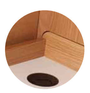
Light oak and white