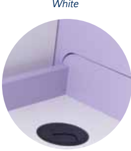
Lilac and white