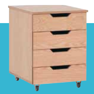
Under-desk 4 drawer unit